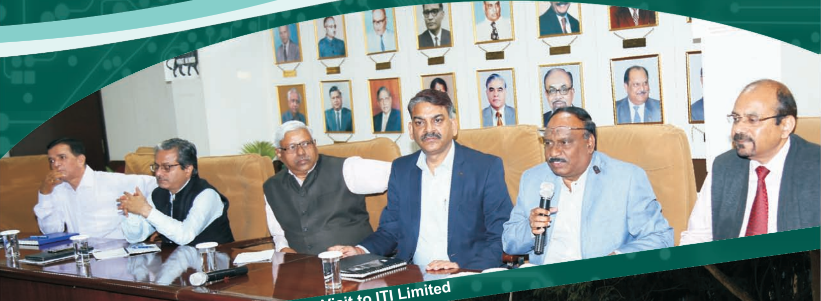
Member (Services) and DoT Officials Visit to ITI Limited