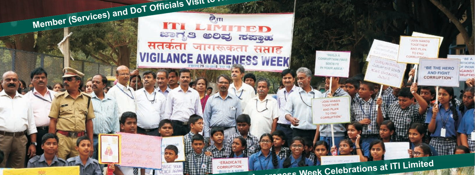
Vigilance Awareness Week Celebrations at ITI Limited